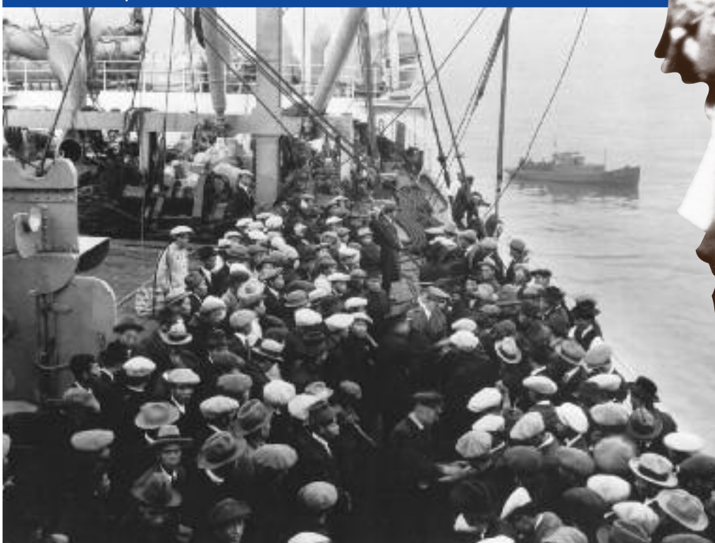
▲ Checking papers on board ship