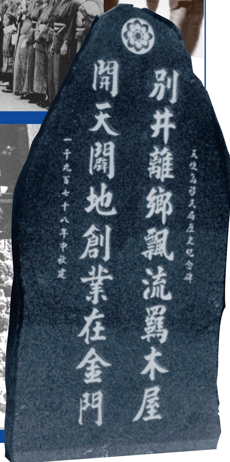
Monument honoring immigrants ►